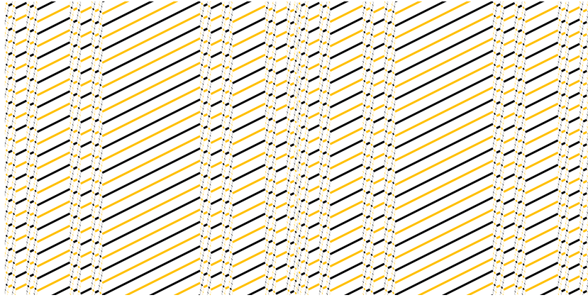
FIGURE 1. Curves satisfying \dot{\gamma}(s) = 1 almost everywhere might fail to be Lipschitz continuous: characteristic curves are indeed required to be absolutely continuous. Absolute continuity automatically improves to C^1 -regularity, due to the continuity of the field. They are then stable under uniform convergence.

Notice that i_\gamma is an integral curve of the vector field (1, \lambda) .